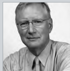
Tom Peters Author of In Search of Excellence: Lessons from America's Best Run Companies